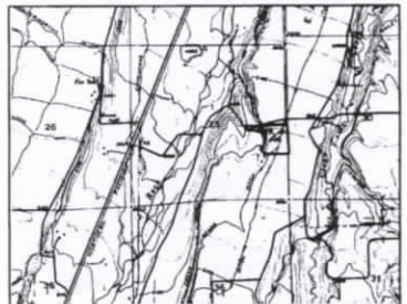
VICINITY MAP SCALE 1"=2000'